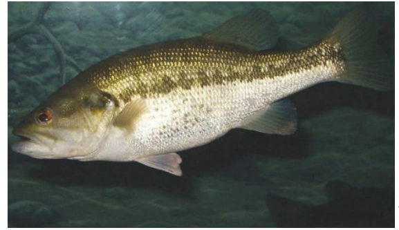
Robert H. Pos

Habitat: Freshwater lakes, rivers, large streams, farm ponds, and brackish marshes; submerged rocks, woody debris, and aquatic vegetation where small fish (prey) hide.