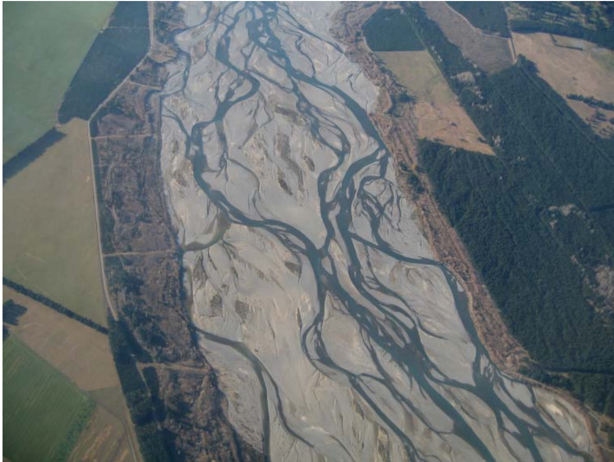
Many meanders: a braided stream