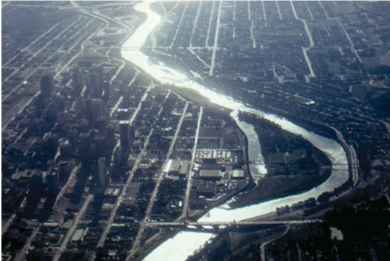
Very little meander