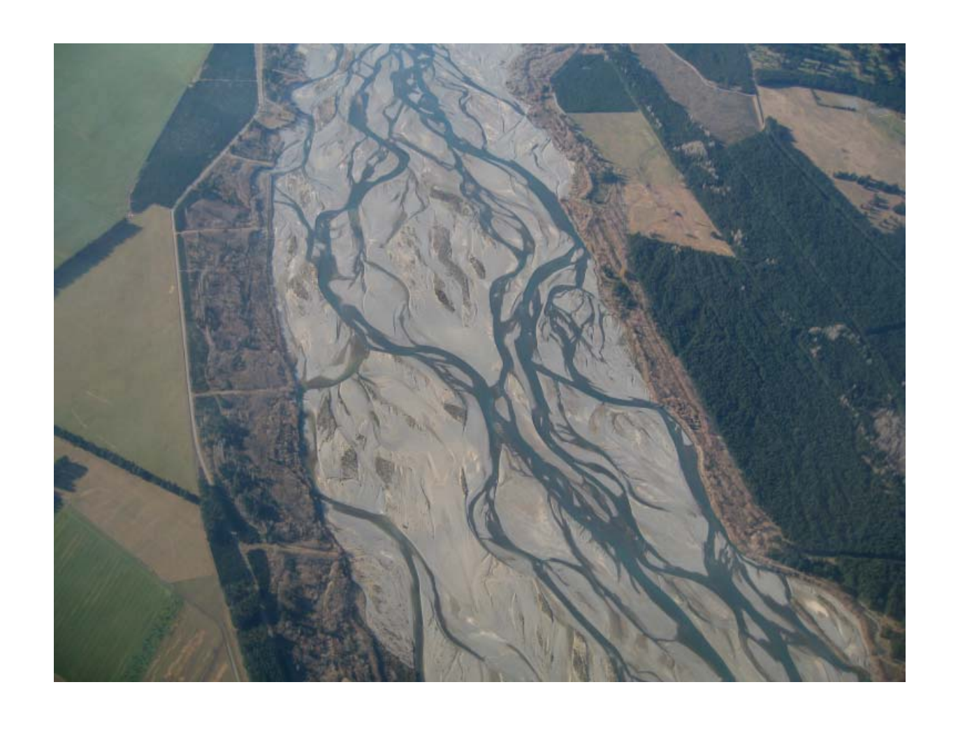
Many meanders: a braided stream