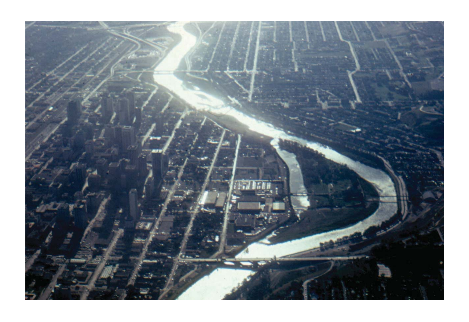
Very little meander