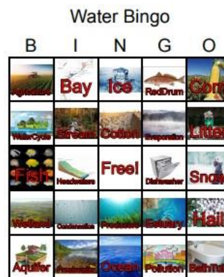
Figure 1. Game card