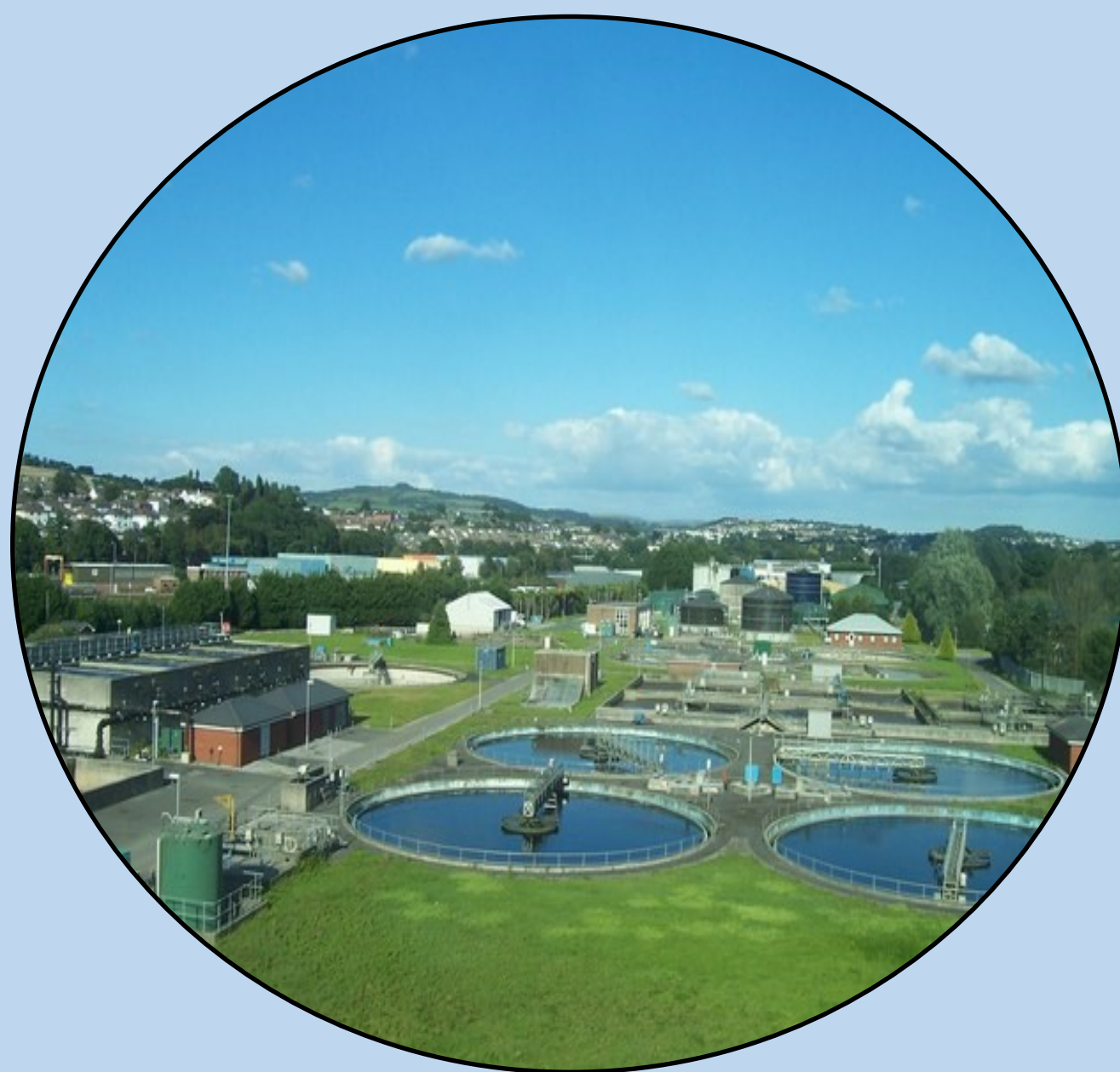
Water treatment facility