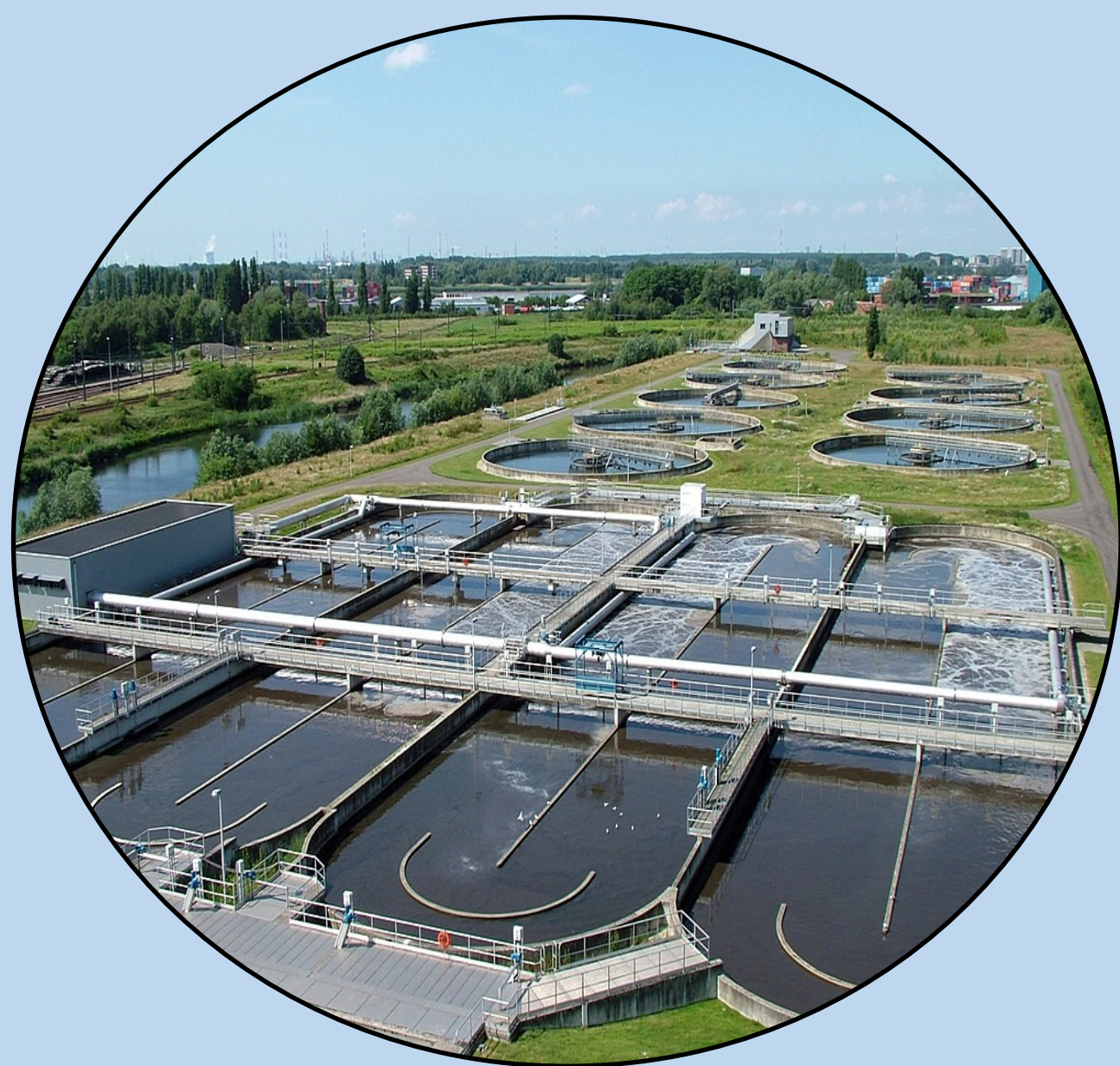
Wastewater treatment facility