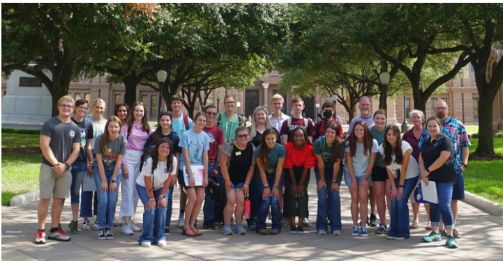
Your Texas 4-H Congress Leadership Team!

Did you know that the light bulbs on the chandeliers in the House chambers form the letters to spell "TEXAS"? See if you can spot them today!!!