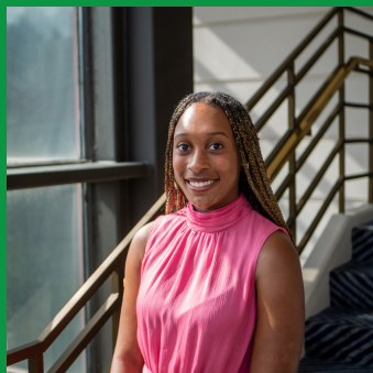
LIEUTENANT GOVERNOR: Hanniah Norl

The Lieutenant Governor presides over the Senate and ensures a smooth flow of legislation in the Senate.