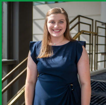
GOVERNOR: Miranda Skaggs

The Governor is responsible for recommending certain bills he/she wishes to be passed, urging defeat of others, and approving or vetoing bills passed by the 4-H Legislature.