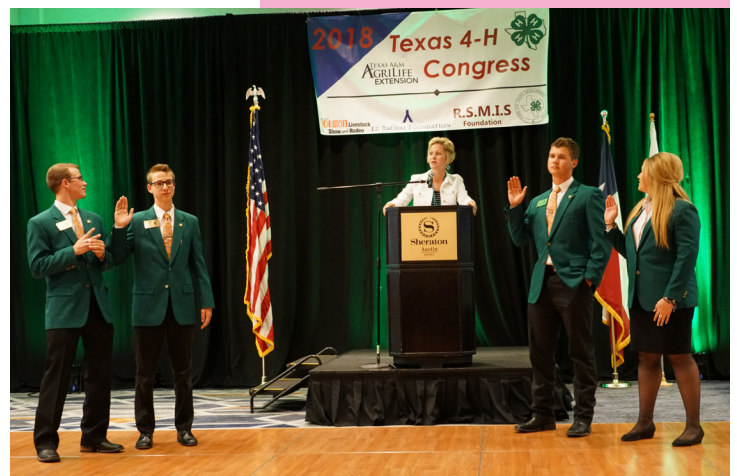
Dodd swears in new legislative officials serving at congress.

Check out our blog! Scan the QR code with your camera to access.