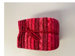
Example Jelly Roll